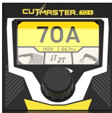
Simple and intuitive TFT LCD panel